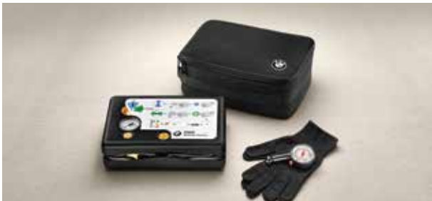
Tyre Mobility Kit