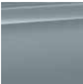
Sparkling Copper Grey.