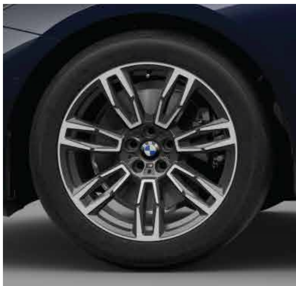
19" M Double-spoke Style 935 M in Bicolour Midnight Grey