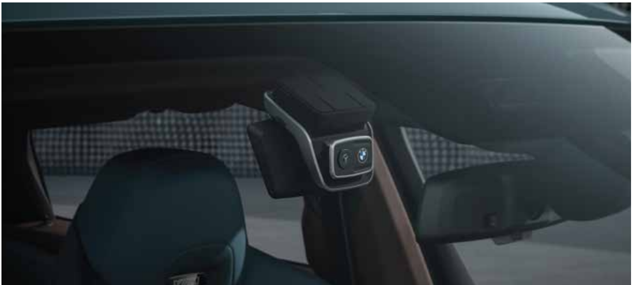
Advanced Car Eye 3.0 PRO