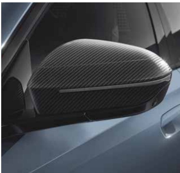
Mirror Caps in Carbon Fibre