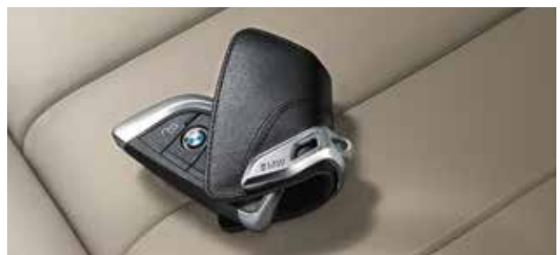
Key Fob in Leather