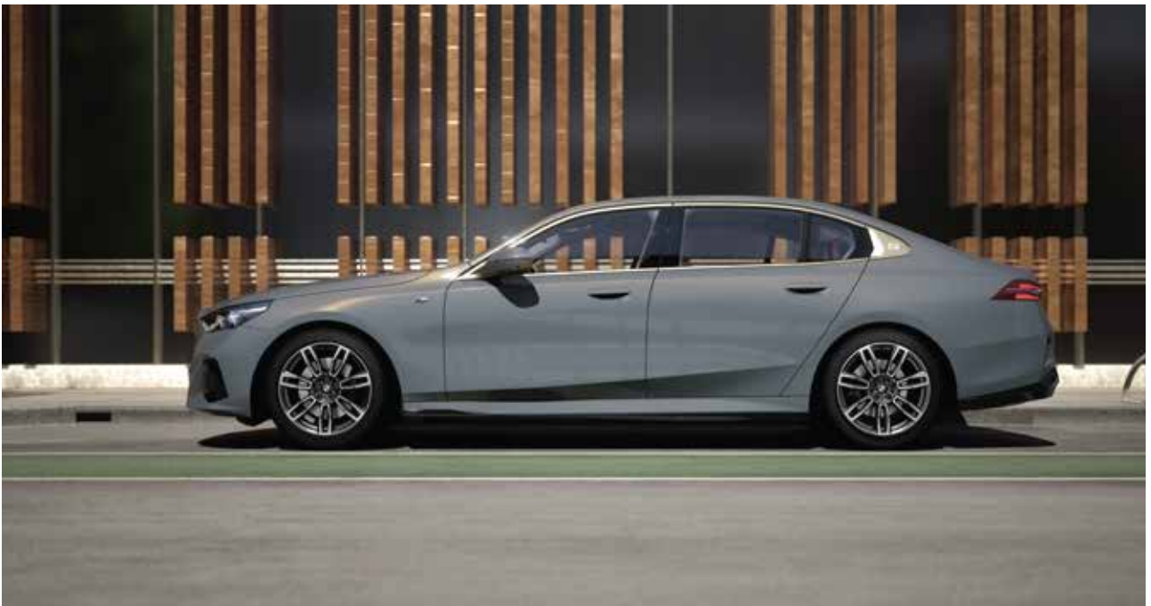
19" M light alloy wheels Double-spoke style 935 M Bicolour Midnight Grey. (Optional upgrade)