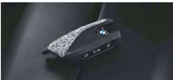
Key Fob in Crystal Clarity