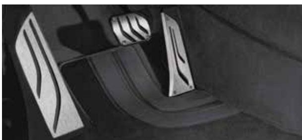
Stainless Steel Footrest