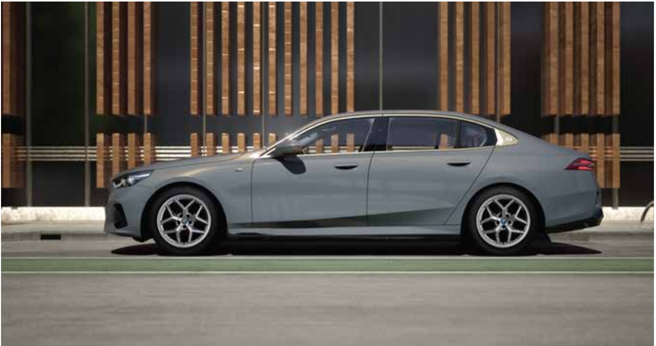
18" light alloy wheels Y-spoke style 932 Lightning Grey.